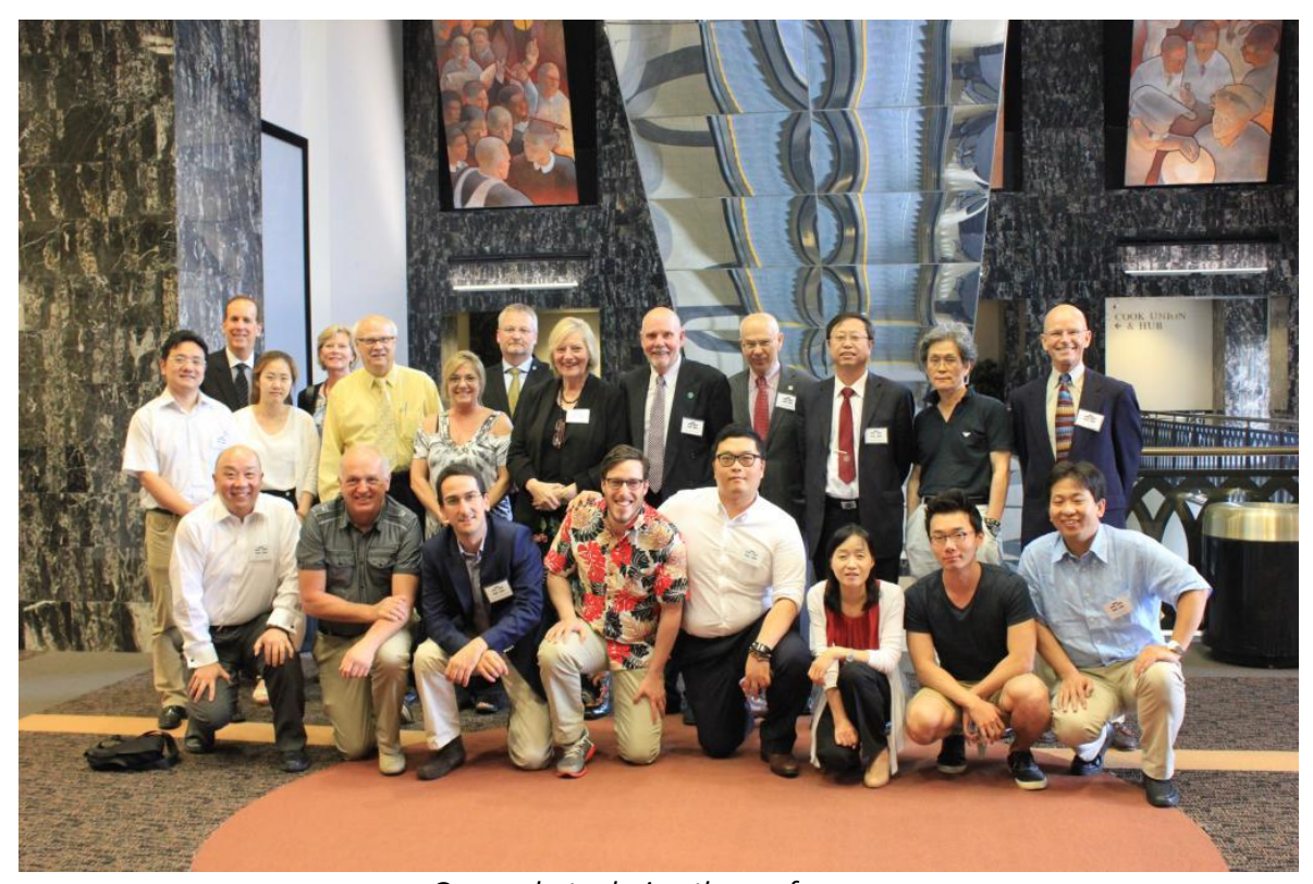
Group photo during the conference

The conference was hosted by the University of Southern Mississippi (USM) in Hattiesburg, Mississippi, and this conference marked the return of a TIEMS conference to the USA after a number of years since the last conference of TIEMS in Washington D.C. in 1998 and a workshop same place in 2003. Attendees and organizers agreed that the conference was a great success – high-quality presentations, attendees from ten countries fully engaged in great discussions and networking, and a friendly, relaxed atmosphere to enjoy each other's company in the hospitable Southern USA!