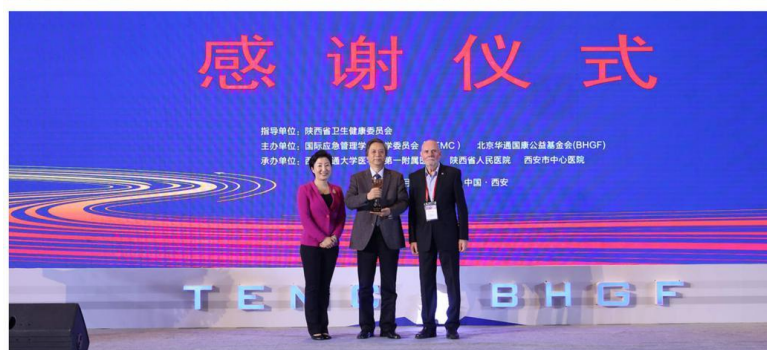
Awarding the Trophy for ever host