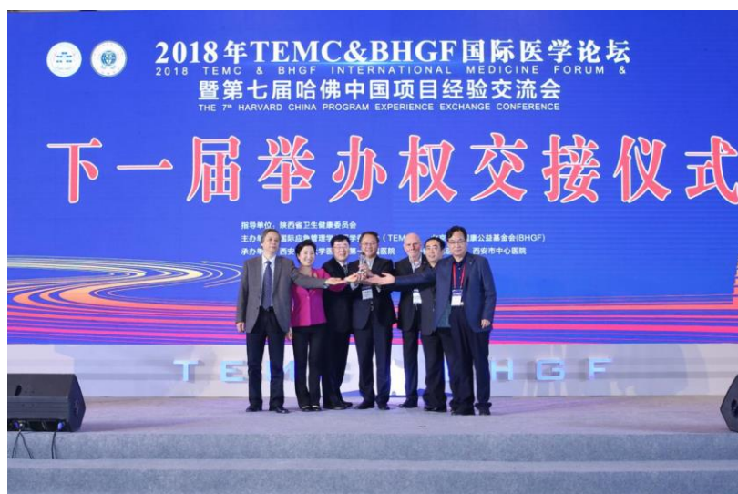
The Trophy Hand-Over ceremony for 2019 medical forum host cities