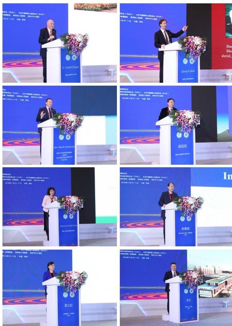
Distinguished guests making speech