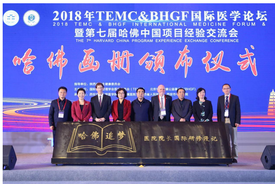
Learning reports Album- issuing ceremony