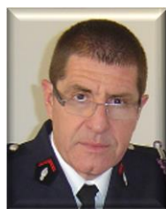
Jean-Paul Monet Europe