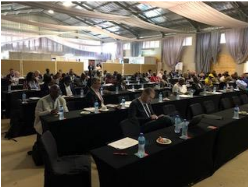
The audience at the DMISA Conference

Keywords: ethics, cyclones, floods, Eline, Favio, Dineo, Idai, Kenneth, Southern Africa