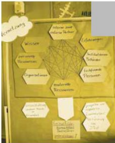
Recommendations for Action Based on Research Results