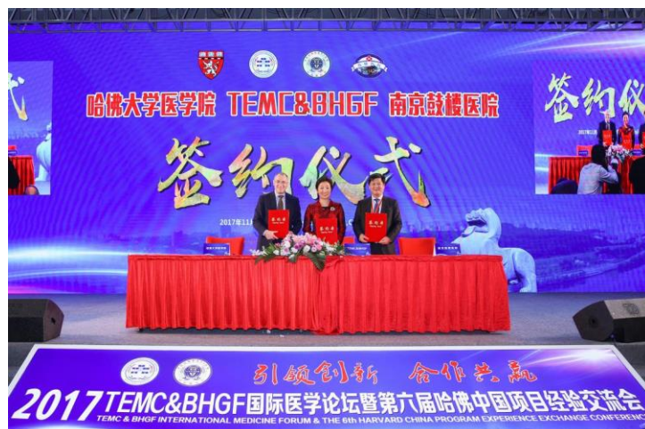
Harvard Medical School, TEMC&BHGF and Nanjing Drum Tower Hospital formally signed Tri-parties cooperation agreement