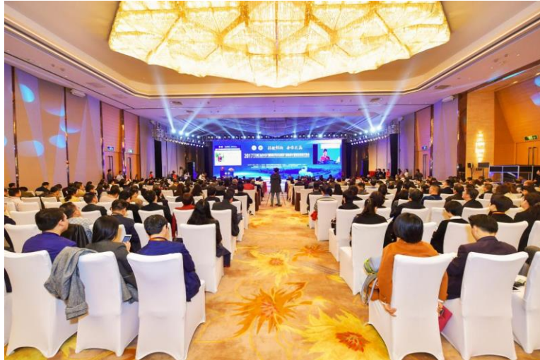
Main Conference Site