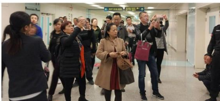
Participants visiting Nanjing Drum Tower Hospital