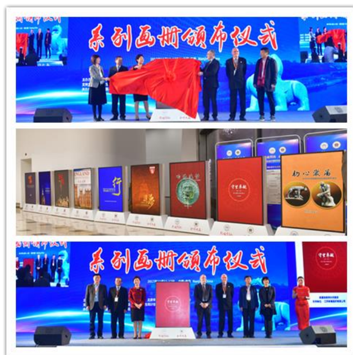
Learning reports Album- issuing ceremony