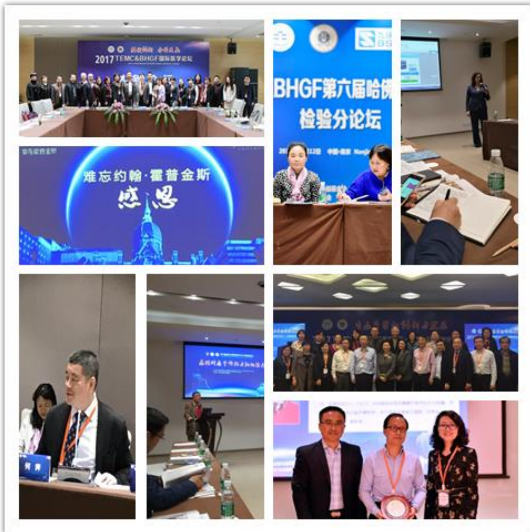
Photos of sub-forum