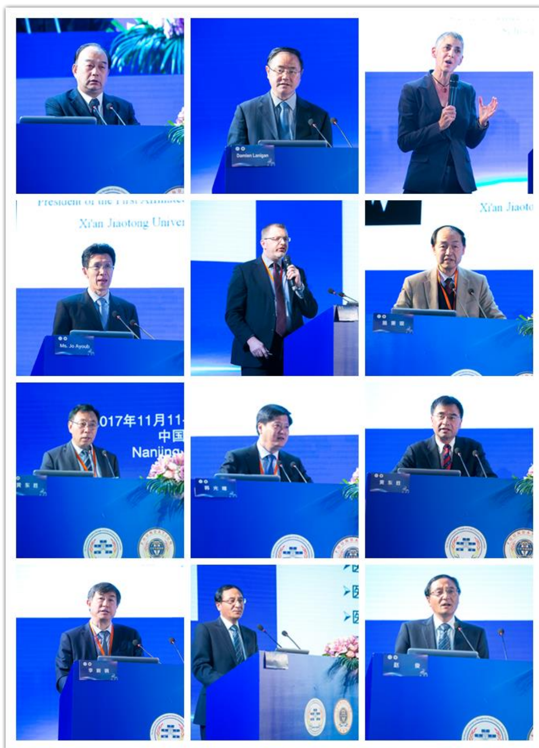
The President' Sub-forum