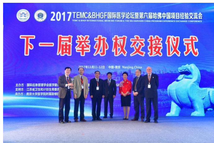
The Trophy Hand-Over ceremony for 2018 medical forum host city