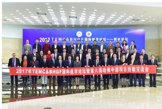
Group Photo of President Forum Delegation